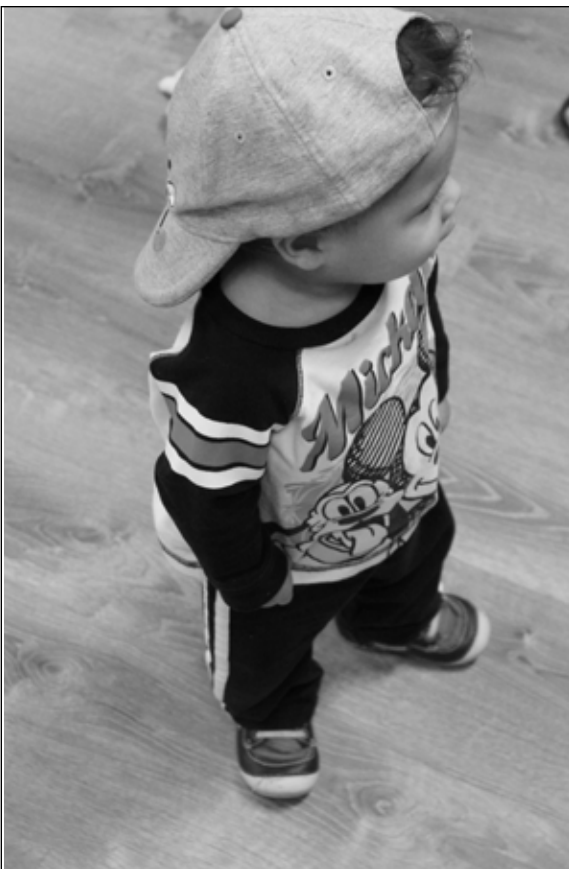
I've got it all figured out!