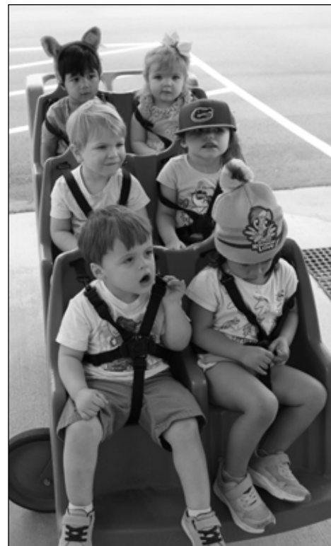
Oh, the places we will go.