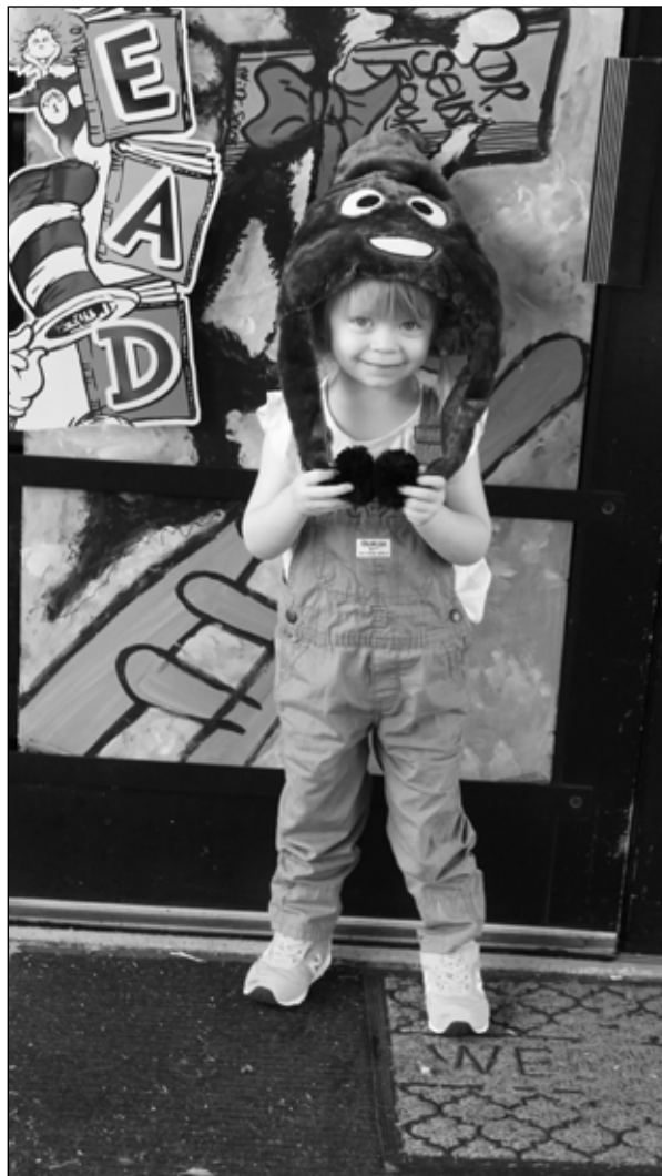
Entering the world of Dr. Seuss.