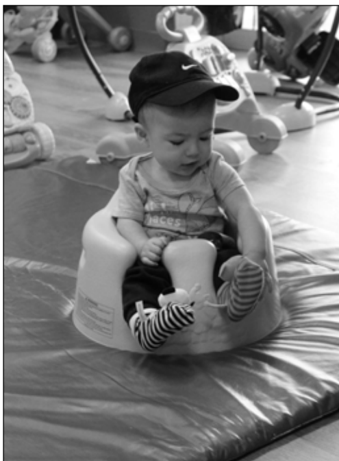
Silly socks for a sweet baby.