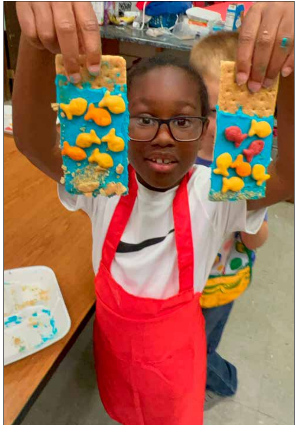
Fishy ingredients in the cooking class.