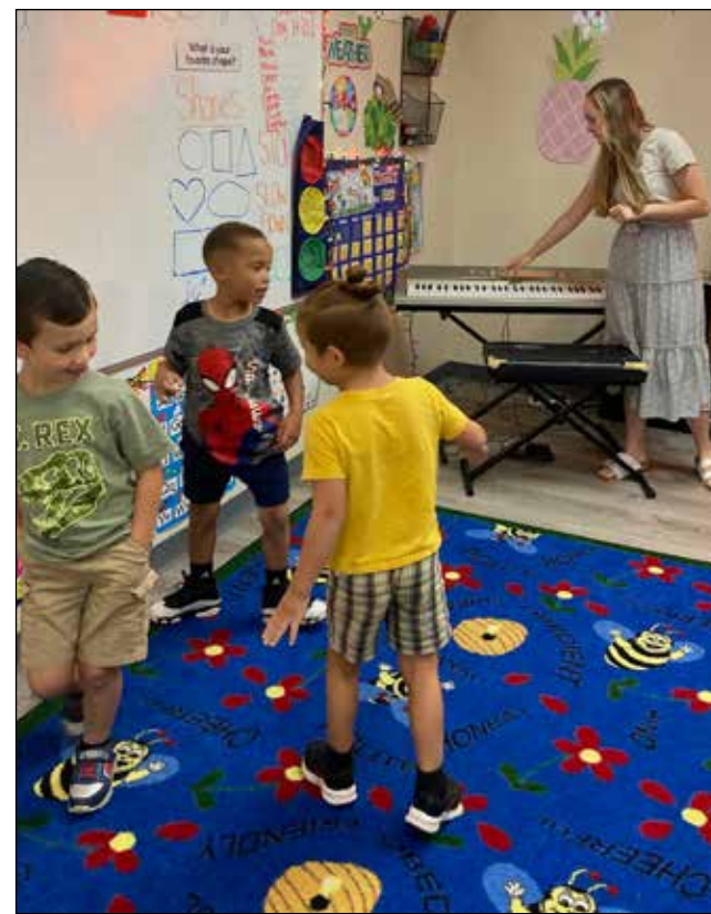
Getting in step with the Pre-K Summer Music Program.