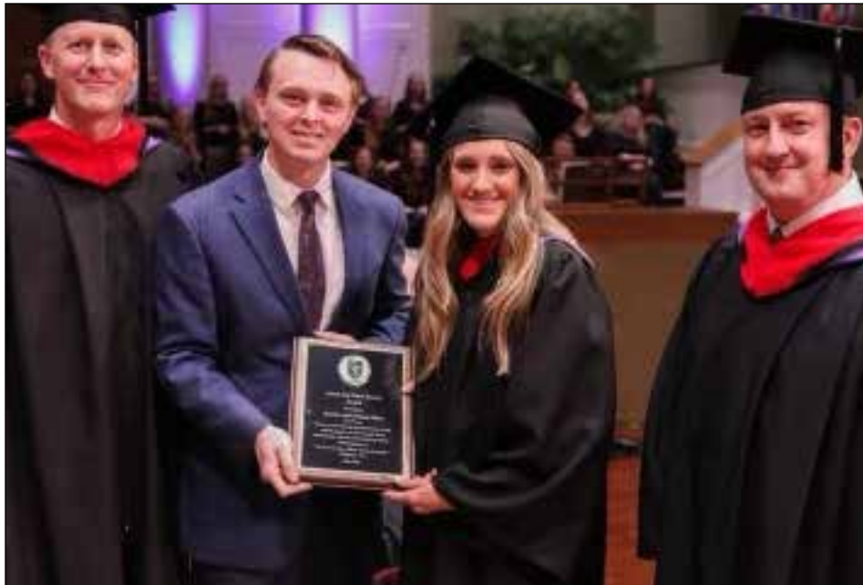
Lighthouse Christian School Alumni in Action