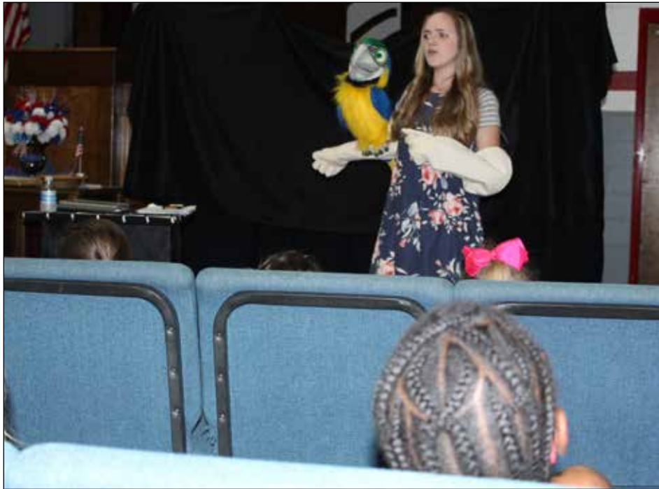
Bible Island Summer Camp has a Chapel service every Wednesday with many animal friends.