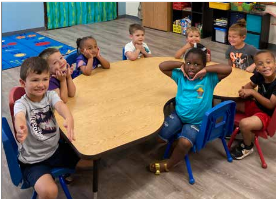
"Turtle-y" awesome summer for preschool.